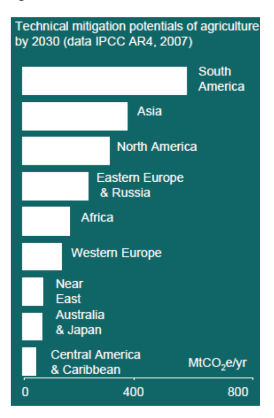
Figure 1 Technical mitigation potential from agriculture

The Intergovernmental Panel on Climate Change (IPCC) estimates that 70% of technical mitigation potential from agricultural GHG emissions is in developing countries, as depicted in Figure 1 (Smith et al. 2007, Müller 2009). While the IPCC estimates the greatest mitigation potential lies with increased soil carbon sequestration via cropland and grazing land management, forestry and agroforestry initiatives, reduced tillage practices, improving efficiency of nutrient management and restoring degraded lands, it is clear that another critical mitigation strategy is to avoid carbon emissions from land